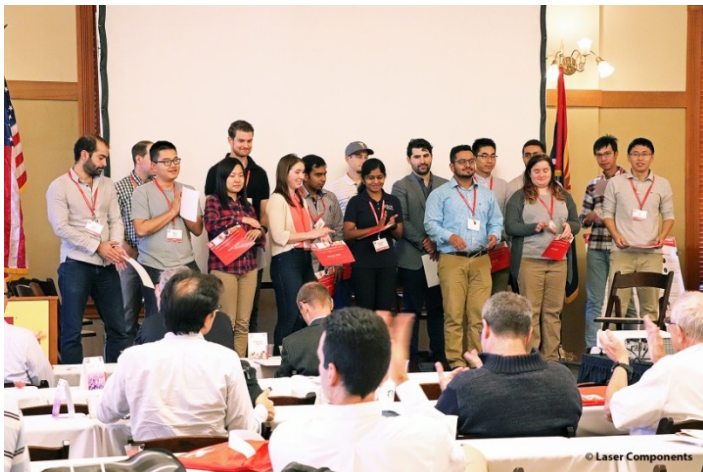
Poster presenters during the Award Ceremony.